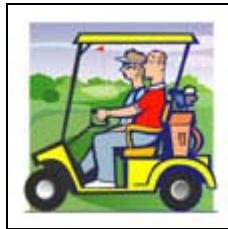
Movers & Shakers