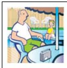
Pools & Patios

Ethnic Diversity: Mostly White Family Types: Couples Age Range: 45+ Education Level: College Grad+ Employment Level: Prof, White-Collar Housing Type: Homeowners Cluster Urbanacity: Suburban