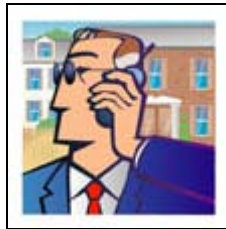
Money & Brains