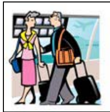
New Empty Nests

Ethnic Diversity: Mostly White Family Types: Couples Age Range: 65+ Education Level: College Grad+ Employment Level: Prof, White-Collar Housing Type: Homeowners Cluster Urbanacity: Suburban