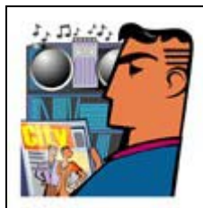
Big City Blues