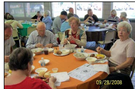
Lakewood Park, Women's Pavilion

Thanks to all who came to help prepare. Thanks to the Lakewood High School Kiwanis Key Club who helped with the serving.