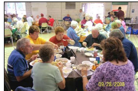
Lakewood Kiwanis 2008 Clam Bake

"Kiwanis is a global organization of volunteers dedicated to changing the world one child and one community at a time."