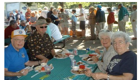
CHICKEN & RIB BARBEQUE