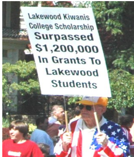
JULY 4 TH PARADE