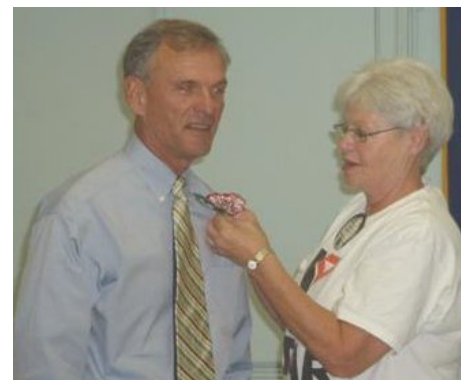
Two birthday guys and a gal!